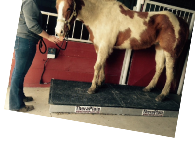
Theraplate provides benefits to both horses and humans.